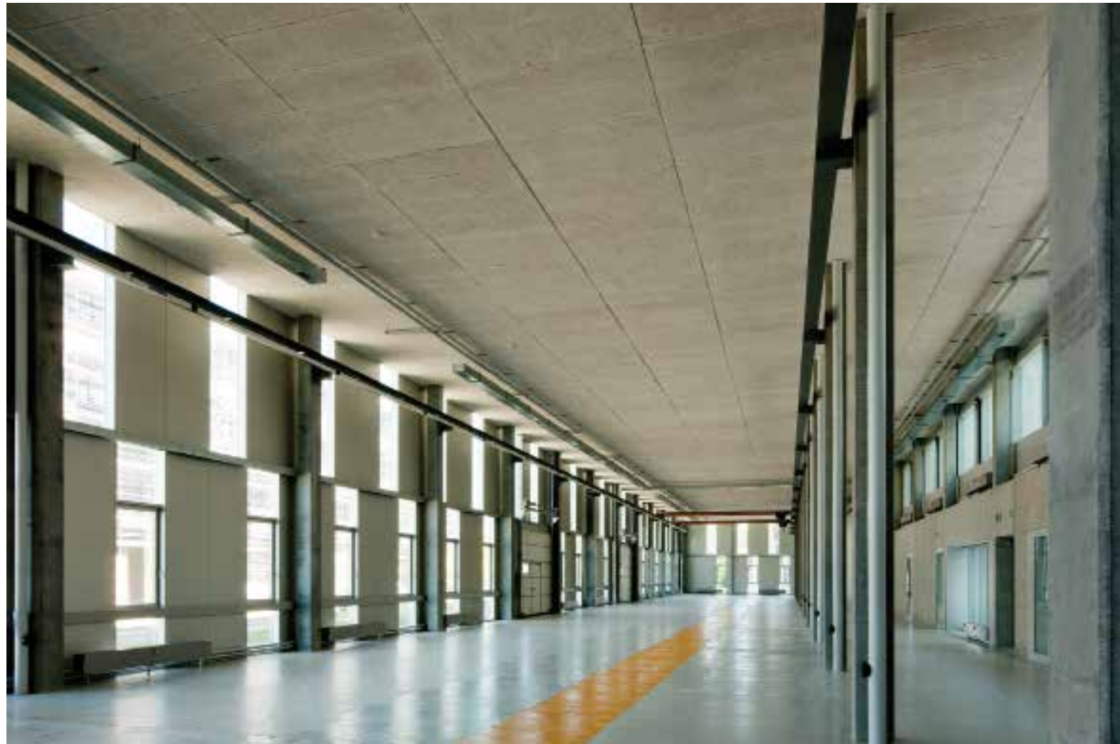
↑ | Factory hall ↓ | Ground floor plan